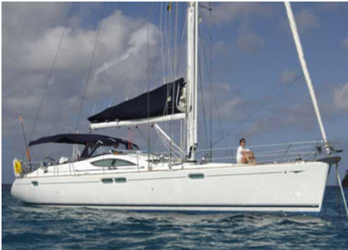
MAGPIE 54' Jeanneau Sloop

Accommodates 4 guests in 3 cabins. Each of the two aft cabins may be configured as en-suite king OR twin berths. The forward cabins may be configured as 2 en-suite doubles OR the partition can be removed making 1 large centerline queen with 2 bathrooms.