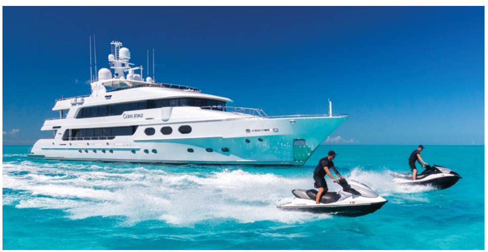
CASINO ROYALE 164' (50m) :: Christensen :: 2008/2018 :: 12 Guests :: 6 Cabins :: 9 Crew Cruising: Maine, New England :: Rate: High $225,000 / Low $225,000 Current Bookings: June 1, 2018 - July 31, 2018: Bahamas to New England