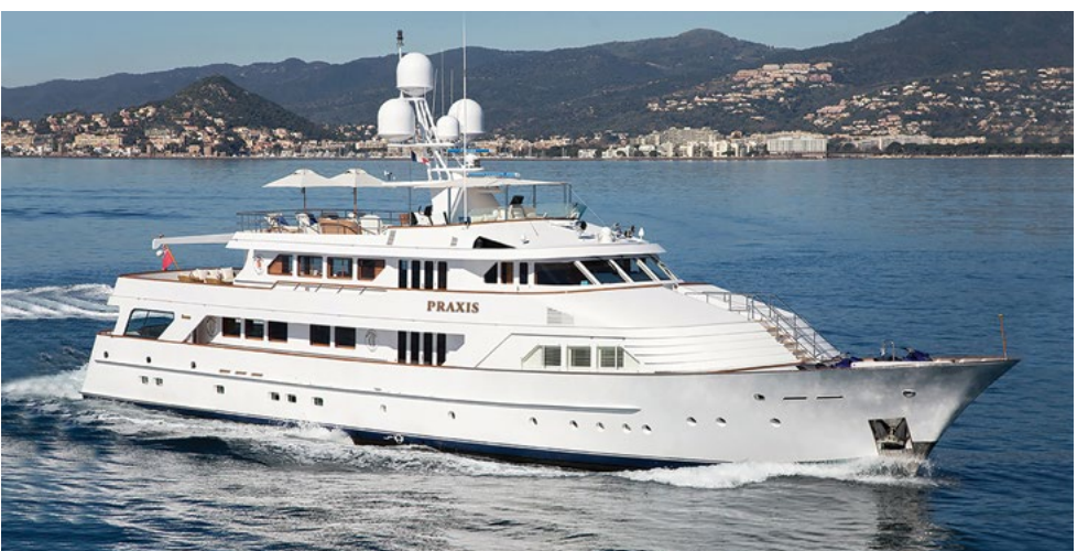
PRAXIS 142' (43m) :: Feadship ::1987/2017 :: 12 Guests :: 5 Cabins :: 9 Crew Cruising: Bahamas, Florida, New England :: Rate: High $150,000 / Low $147,000 Current Bookings: Please inquire

Cruising: Bahamas, New England :: Rate: High $150,000 / Low $150,000 Current Bookings: Apr 27, 2018 - May 29, 2018: Unavailable/Nassau to Nassau; June 2, 2018 - June 8, 2018: Unavailable/Nassau to Nassau; June 10, 2018 - June 15, 2018: Unavailable/Nassau to Nassau; Aug 27, 2018 - Sept 9, 2018: Unavailable/New England to New England