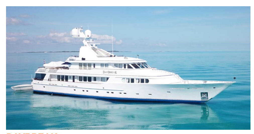
DAYBREAK 153' (46.7m) :: Feadship :: 1997/2015 :: 12 Guests :: 6 Cabins :: 9 Crew

Cruising: Bahamas, New England :: Rate: High $150,000 / Low $150,000 Current Bookings: Apr 27, 2018 - May 29, 2018: Unavailable/Nassau to Nassau; June 2, 2018 - June 8, 2018: Unavailable/Nassau to Nassau; June 10, 2018 - June 15, 2018: Unavailable/Nassau to Nassau; Aug 27, 2018 - Sept 9, 2018: Unavailable/New England to New England