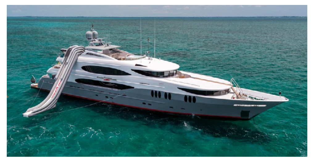
ZOOM ZOOM 161' (49m) :: Trinity :: 2005/2016 :: 10 Guests :: 5 Cabins :: 10 Crew Cruising: Bahamas, Florida, New England :: Rate: High $180,000 / Low $180,000 Current Bookings: May 26, 2018 - June 2, 2018: Nassau to Nassau; June 3, 3018 - June 12, 2018: Nassau to Nassau;

Current Bookings: May 26, 2018 - June 2, 2018: Nassau to Nassau; June 3, 3018 - June 12, 2018: Nassau to Nassau; June 27, 2018 - July 20, 2018: Portland to Boston; July 21, 2018 - July 23, 2018: New England to New England; Aug 5, 2018 - Aug 28, 2018: Newport to Nantucket