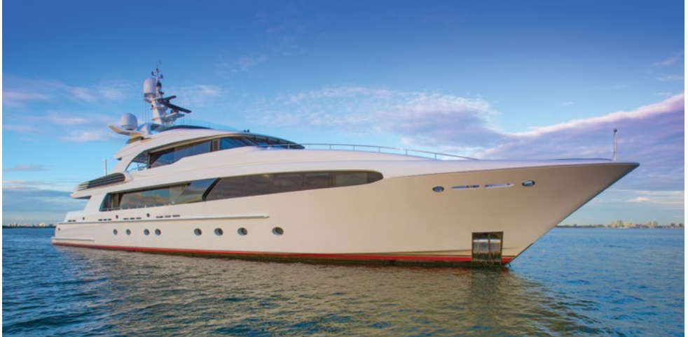
USHER 154' (47m) :: Delta Marine :: 2007/2017 :: 12 Guests :: 5 Cabins :: 10 Crew Cruising: Bahamas, Florida, New England :: Rate: High $225,000 / Low $179,500 Current Bookings: Apr 4, 2018 - Apr 30, 2018: Ft Lauderdale to Annapolis; June 16, 2018 - June 23, 2018: Annapolis to Nantucket

Current Bookings: May 26, 2018 - June 2, 2018: Nassau to Nassau; June 3, 3018 - June 12, 2018: Nassau to Nassau; June 27, 2018 - July 20, 2018: Portland to Boston; July 21, 2018 - July 23, 2018: New England to New England; Aug 5, 2018 - Aug 28, 2018: Newport to Nantucket