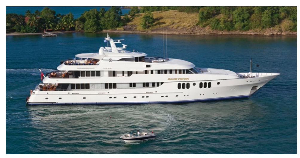
BLUE MOON 198' (60m) :: Feadship :: 2005/2014 :: 12 Guests :: 6 Cabins :: 17 Crew Cruising: Bahamas, Florida, New England :: Rate: High $395,000 / Low $395,000 Current Bookings: June 1, 2018 - Sept. 15, 2018: Flexible Use/Great Lakes to Great Lakes; Dec. 22, 2018 - Jan. 1, 2019: St. Maarten to St. Maarten