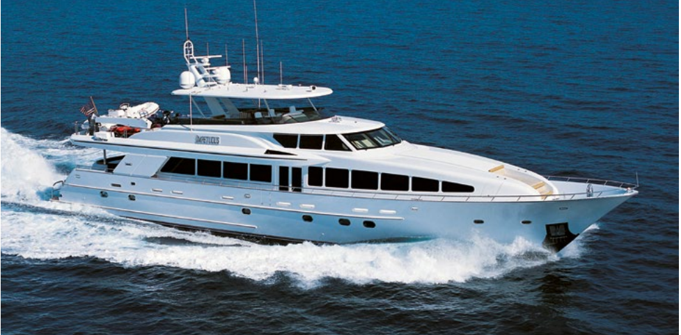
IMPETUOUS 120' (36.6m) :: Crescent :: 2004/2013 :: 9 Guests :: 4 Cabins :: 5 Crew

Current Bookings: May 20, 2018 - June 17, 2018: Flexible Use/Palm Beach to Newport; June 18, 2018 - June 21, 2018: Newport Charter Show