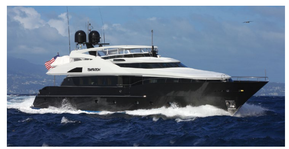
TEMPTATION 123' (37.5m) :: Palmer Johnson :: 2005/2017 :: 8 Guests :: 4 Cabins :: 5 Crew Cruising: New England :: Rate: High $65,000 / Low $65,000

Current Bookings: May 20, 2018 - June 17, 2018: Flexible Use/Palm Beach to Newport; June 18, 2018 - June 21, 2018: Newport Charter Show