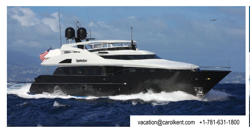
TEMPTATION 123' (37.5m) :: Palmer Johnson :: 2005/2017 :: 8 Guests :: 4 Cabins :: 5 Crew Cruising: New England :: Rate: High $65,000 / Low $65,000

Current Bookings: May 20, 2018 - June 17, 2018: Flexible Use/Palm Beach to Newport; June 18, 2018 - June 21, 2018: Newport Charter Show