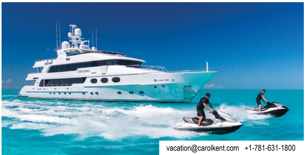
CASINO ROYALE 164' (50m) :: Christensen :: 2008/2018 :: 12 Guests :: 6 Cabins :: 9 Crew Cruising: Maine, New England :: Rate: High $225,000 / Low $225,000 Current Bookings: June 1, 2018 - July 31, 2018: Bahamas to New England