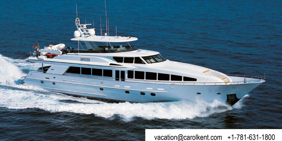
IMPETUOUS 120' (36.6m) :: Crescent :: 2004/2013 :: 9 Guests :: 4 Cabins :: 5 Crew

Current Bookings: May 20, 2018 - June 17, 2018: Flexible Use/Palm Beach to Newport; June 18, 2018 - June 21, 2018: Newport Charter Show