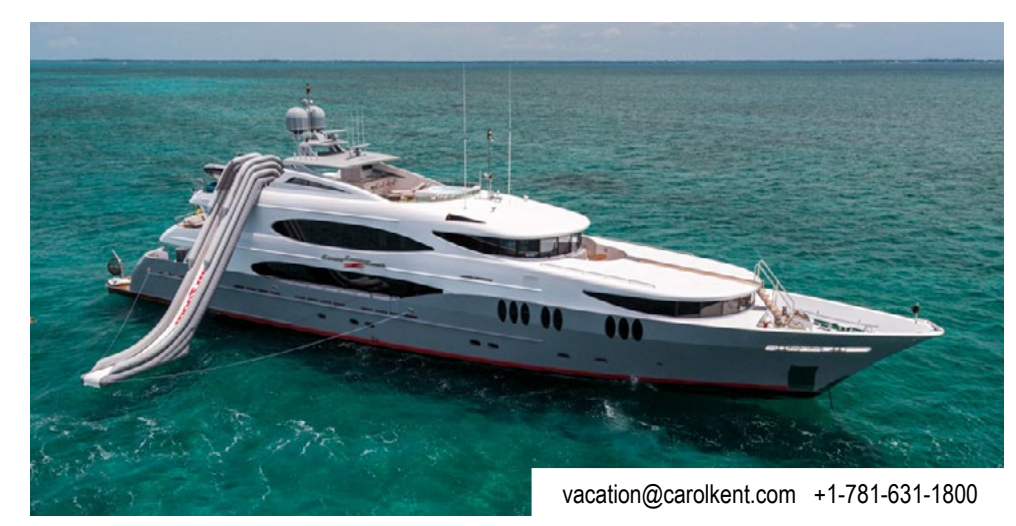
ZOOM ZOOM 161' (49m) :: Trinity :: 2005/2016 :: 10 Guests :: 5 Cabins :: 10 Crew Cruising: Bahamas, Florida, New England :: Rate: High $180,000 / Low $180,000 Current Bookings: May 26, 2018 - June 2, 2018: Nassau to Nassau; June 3, 3018 - June 12, 2018: Nassau to Nassau;

Current Bookings: May 26, 2018 - June 2, 2018: Nassau to Nassau; June 3, 3018 - June 12, 2018: Nassau to Nassau; June 27, 2018 - July 20, 2018: Portland to Boston; July 21, 2018 - July 23, 2018: New England to New England; Aug 5, 2018 - Aug 28, 2018: Newport to Nantucket