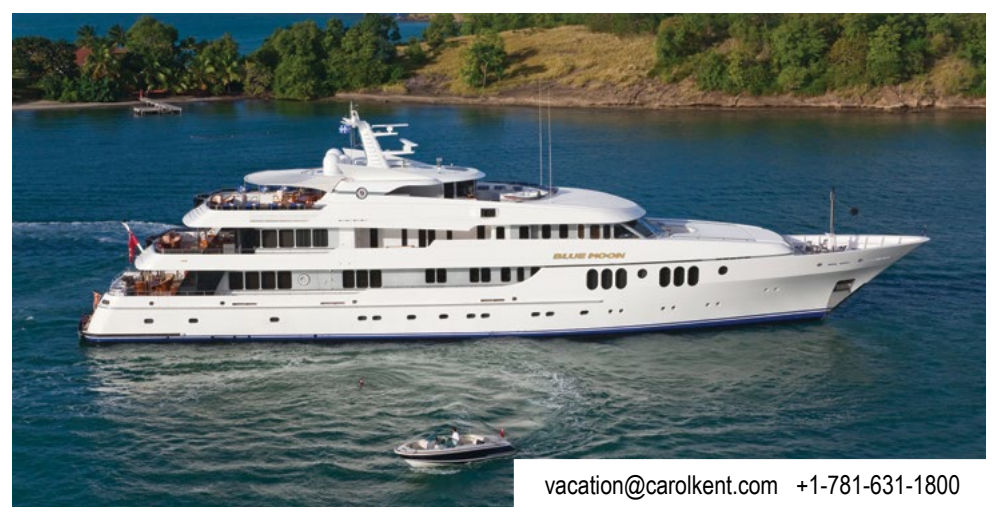
BLUE MOON 198' (60m) :: Feadship :: 2005/2014 :: 12 Guests :: 6 Cabins :: 17 Crew Cruising: Bahamas, Florida, New England :: Rate: High $395,000 / Low $395,000 Current Bookings: June 1, 2018 - Sept. 15, 2018: Flexible Use/Great Lakes to Great Lakes; Dec. 22, 2018 - Jan. 1, 2019: St. Maarten to St. Maarten