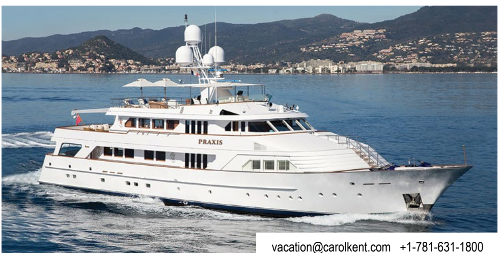
PRAXIS 142' (43m) :: Feadship ::1987/2017 :: 12 Guests :: 5 Cabins :: 9 Crew Cruising: Bahamas, Florida, New England :: Rate: High $150,000 / Low $147,000 Current Bookings: Please inquire

Current Bookings: Apr 27, 2018 - May 29, 2018: Unavailable/Nassau to Nassau; June 2, 2018 - June 8, 2018: Unavailable/Nassau to Nassau; June 10, 2018 - June 15, 2018: Unavailable/Nassau to Nassau; Aug 27, 2018 - Sept 9, 2018: Unavailable/New England to New England