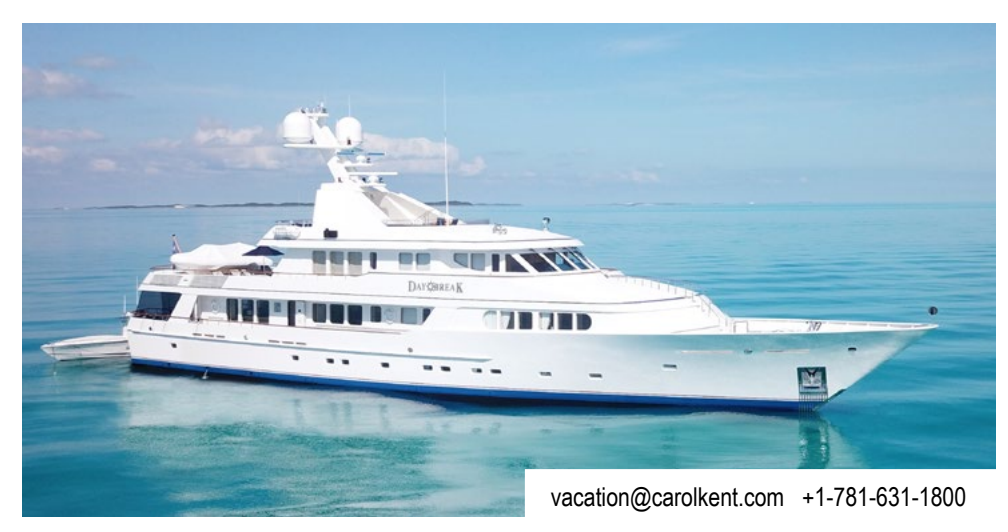
DAYBREAK 153' (46.7m) :: Feadship :: 1997/2015 :: 12 Guests :: 6 Cabins :: 9 Crew

Cruising: Bahamas, New England :: Rate: High $150,000 / Low $150,000