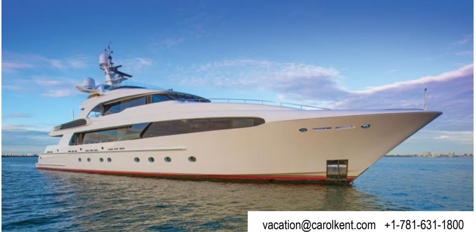
USHER 154' (47m) :: Delta Marine :: 2007/2017 :: 12 Guests :: 5 Cabins :: 10 Crew Cruising: Bahamas, Florida, New England :: Rate: High $225,000 / Low $179,500 Current Bookings: Apr 4, 2018 - Apr 30, 2018: Ft Lauderdale to Annapolis; June 16, 2018 - June 23, 2018: Annapolis to Nantucket

Current Bookings: May 26, 2018 - June 2, 2018: Nassau to Nassau; June 3, 3018 - June 12, 2018: Nassau to Nassau; June 27, 2018 - July 20, 2018: Portland to Boston; July 21, 2018 - July 23, 2018: New England to New England; Aug 5, 2018 - Aug 28, 2018: Newport to Nantucket